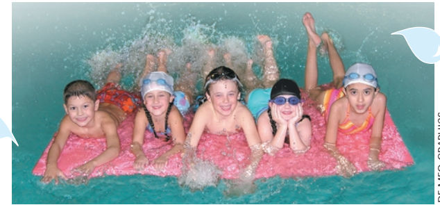
DE MEO GRAPHICS